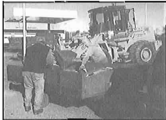
Twp. employees unload items at previous clean-up

The Schnecksville Fire Co. is located on Old Packhouse Road off of Route 309, across from the Exxon Gas Station. Gate will close promptly at noon.